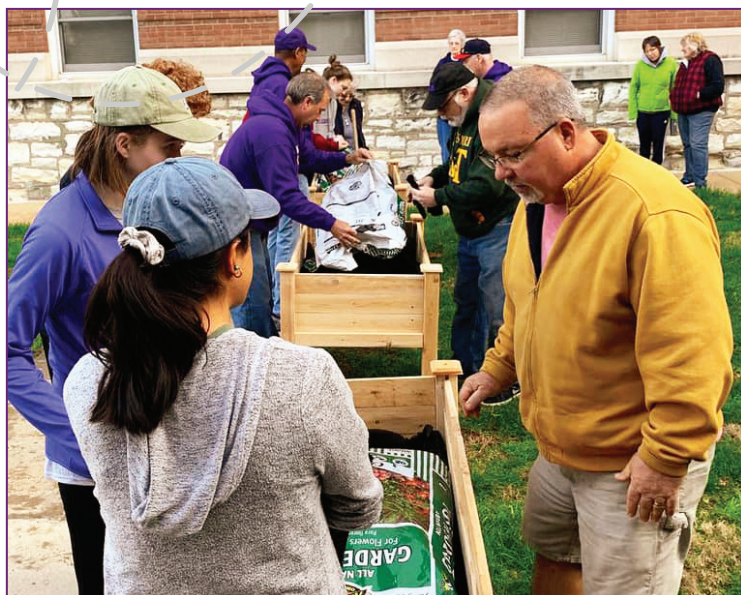
R-K students, parents, and staff came together to help with the SSND Garden Build Project.