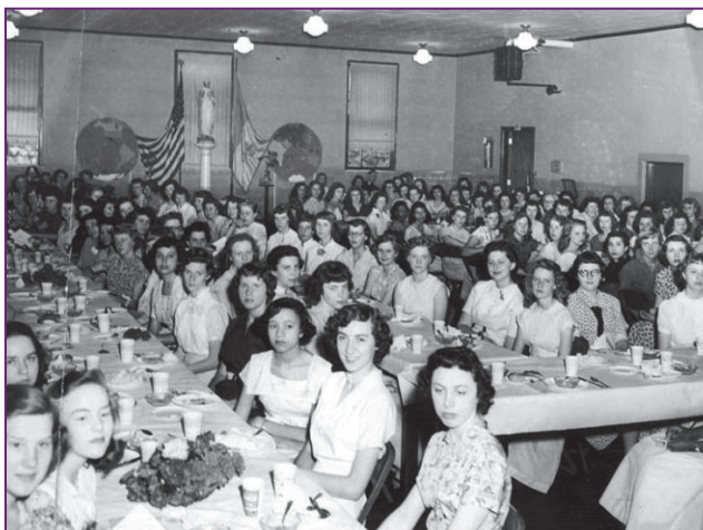
The Class of 1950 gathered for the annual Alumnae Graduation Breakfast.