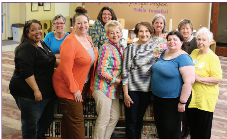
R-K alumnae from many different years gather each month for the Alumnae Association meetings.