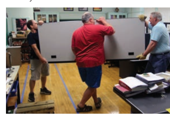
R-K dads helped with the heavy lifting.

Bit by bit, the R-K dream is becoming a reality.