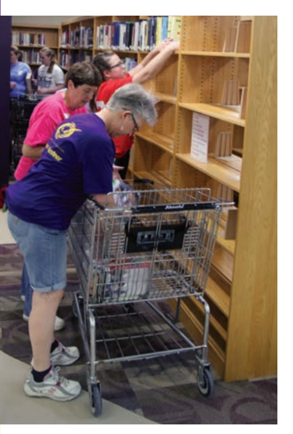
Faculty, staff, students and parents helped in the move.

"Many hands make the work light" is a phrase that is often used. May 16 was a day that this saying was put into action. The Rosati-Kain "can do" spirit was in full force.