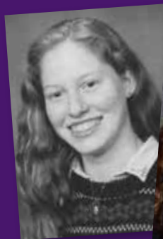
Senior year '97