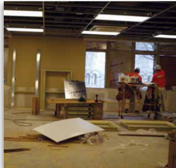
Pictured here are: (top) the new Learning Commons, (above) one of two new science rooms and (below) the new facade facing Newstead Avenue.