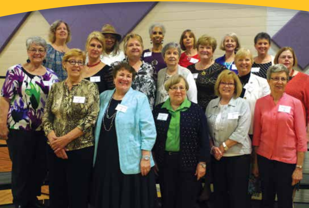
Representing the Class of 1966