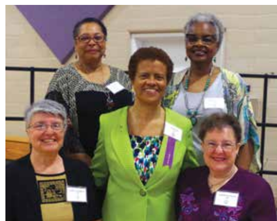
(top) Representing the Class of 1996