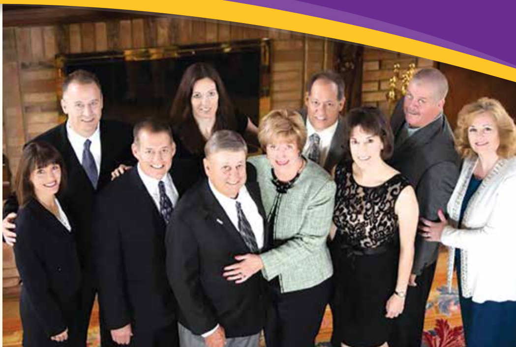
The Imo Family

What they had was everything they wanted. They never looked back and even today continue to grow. Soon Imo's Pizza will have 100 locations