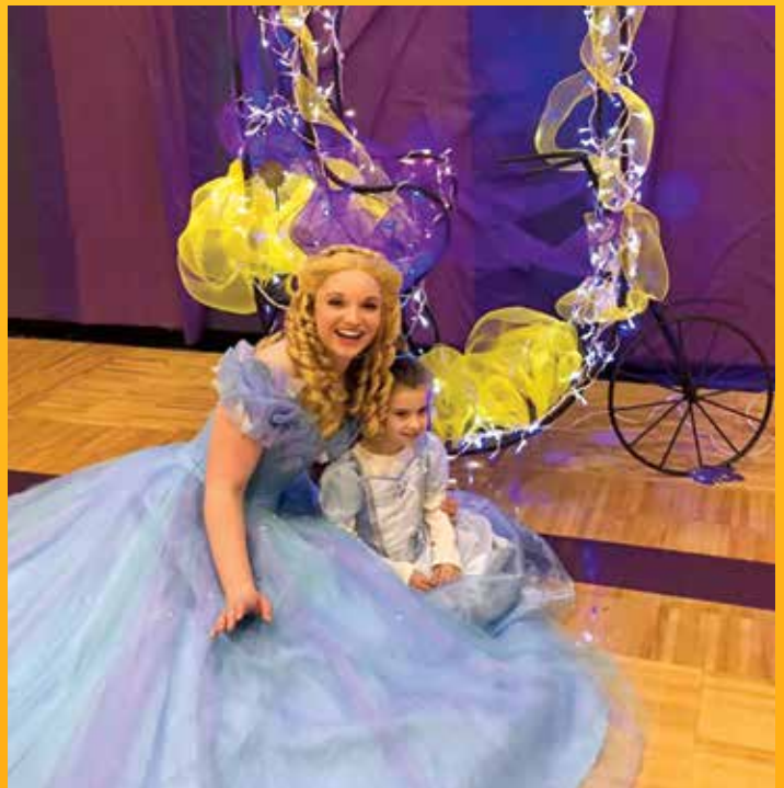
Princess Tea Party, April 2016