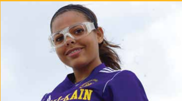
Spring Sports—Soccer, March 2016