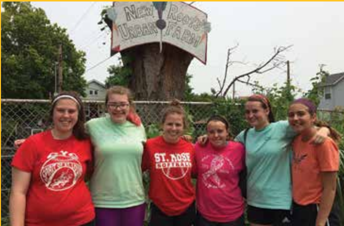
Service Week, July 2015