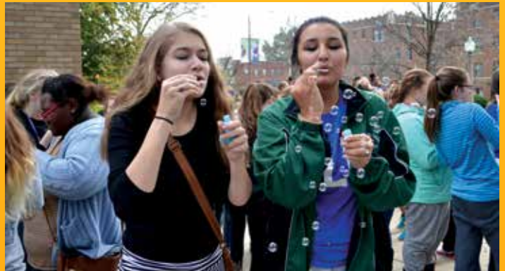
October Day Celebrations, October 2015