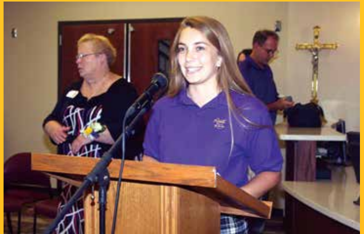
Ribbon Cutting Ceremony, August 2015