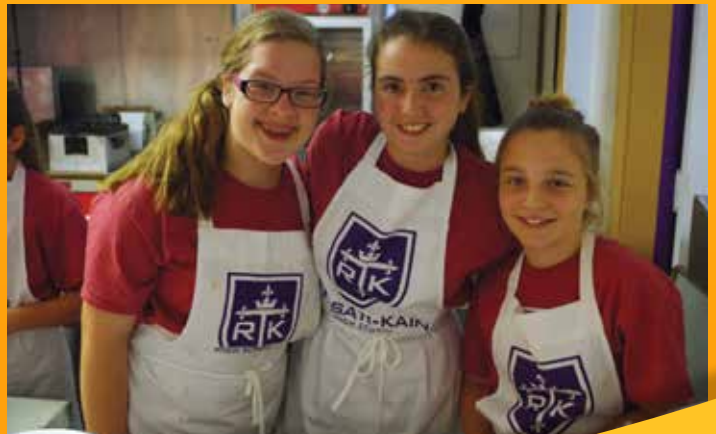
Kougar Kamps, June 2016