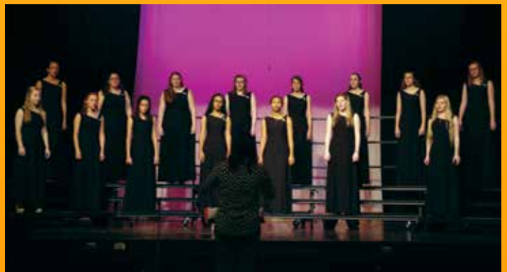
Christmas Concert, December 2015