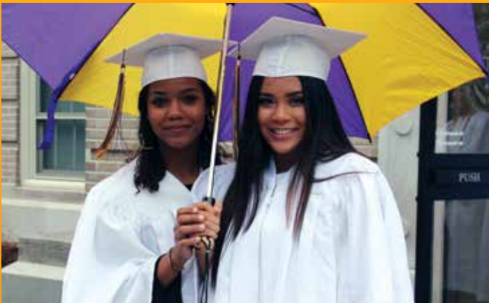
Graduation, May 2016