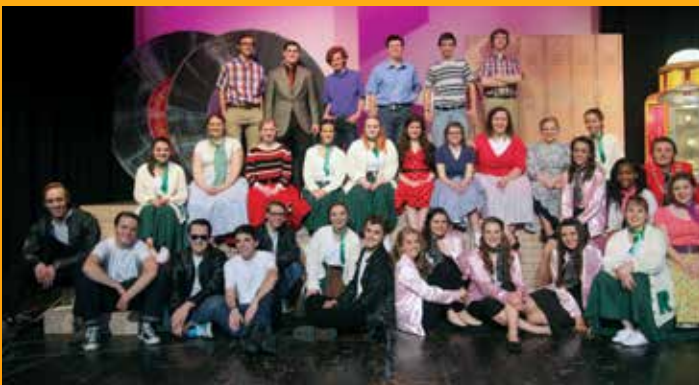
Fall Musical—Grease, November 2015