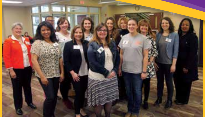
Career Day Speakers, February 2016