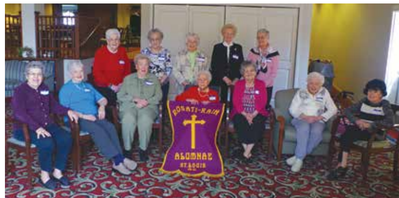
R-K Alumnae gather at Our Lady of Life residential home.