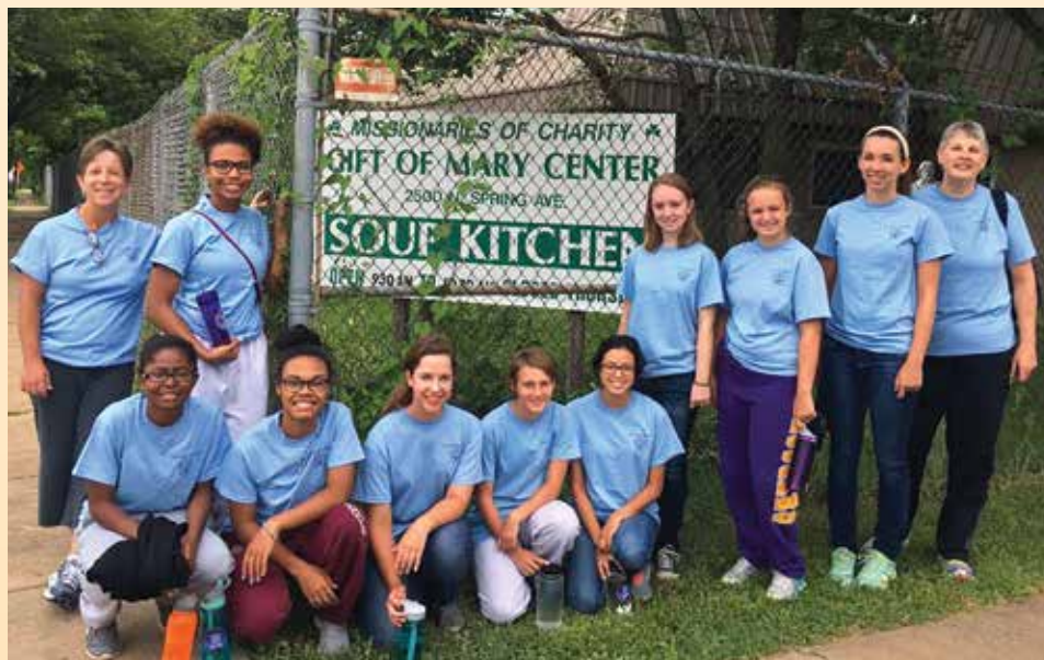
R-K students and faculty during Serve Week 2016

The aspect about service that inspires me the most is the ability to give back to others. I have always been provided with all that I need; it is really cool to see the impact of providing a helping hand to people who are most vulnerable. My Rosati-Kain Service Week experience is one that I will cherish forever.