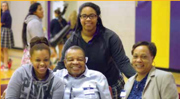
Grandparents' Day, September 2015