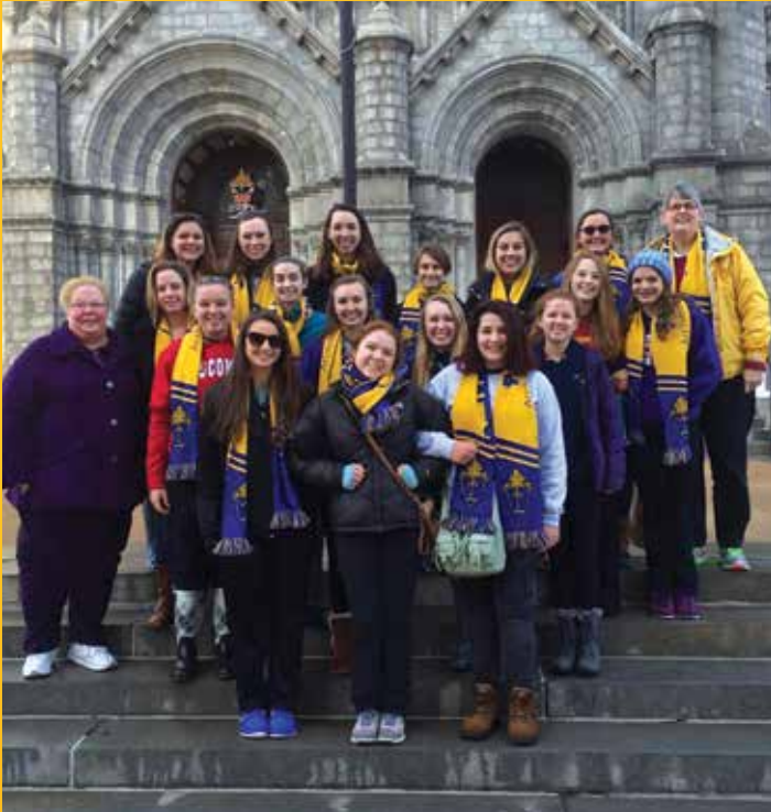
ProLife March in St. Louis, January 2016