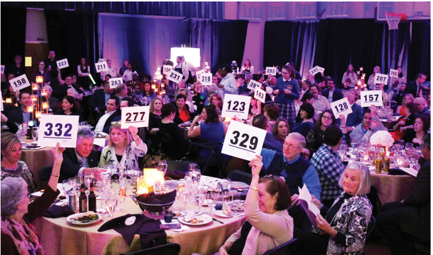
During the $100 level Fund-Our-Future, 104 paddles were raised!