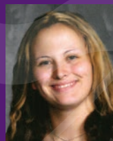
Rosati-Kain Service Award