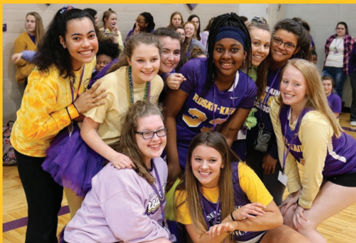
Spring Pep Rally, March 2019