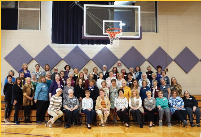
Class of 1968