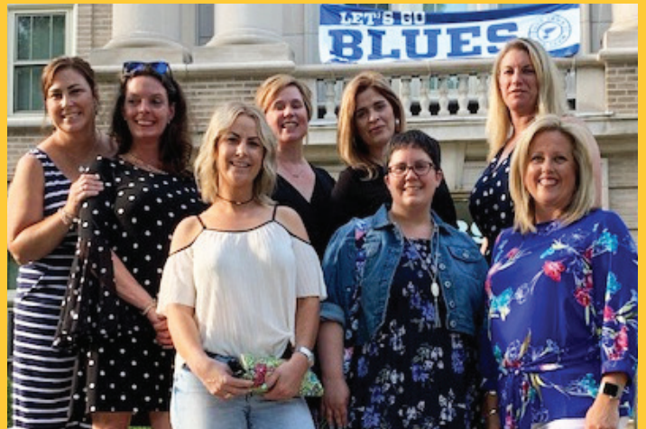
Class of 1994