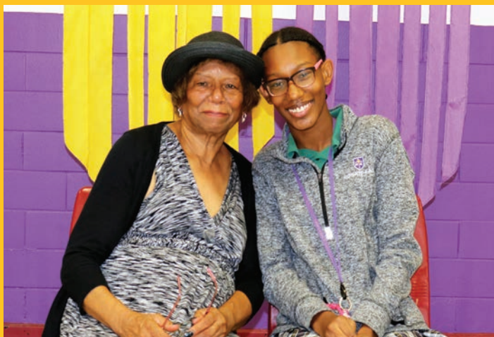
Grandparents' Day, September 2018