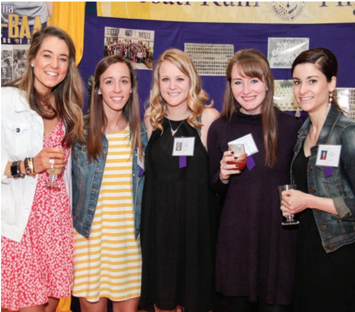
Members of the Classes of 2010 and 2012 gathered at this year's Alumnae Mass & Brunch.

The next Alumnae Mass & Brunch will take place on Sunday, April 26, 2020, and we can't wait to see you all there!