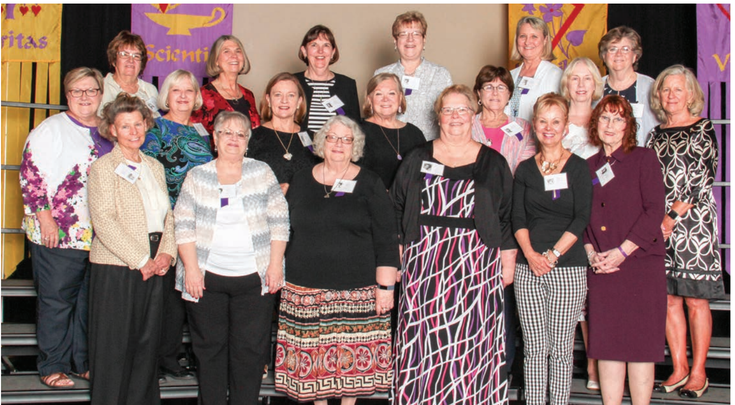
Members of the Class of 1969