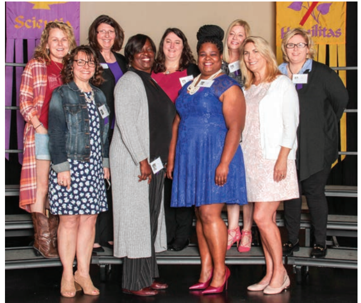
Members of the Class of 1987