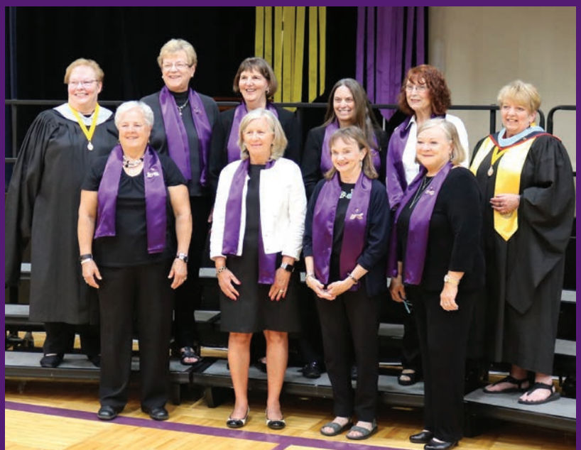
Class of 1969 Honor Guard.