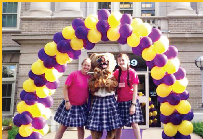
First Day of School, August 2018