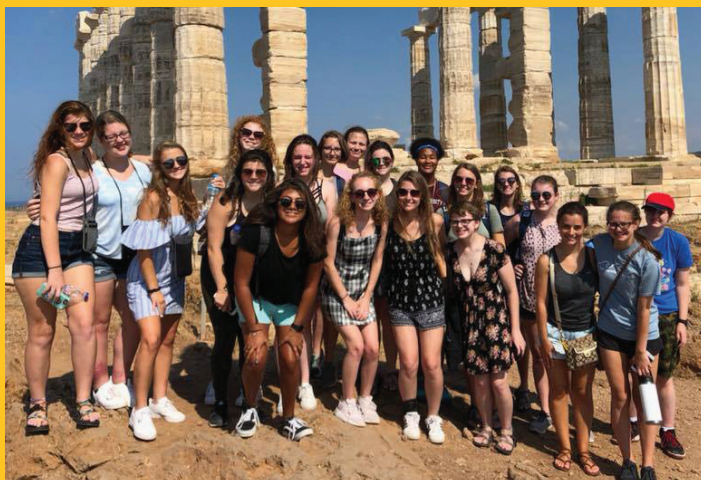
International Summer Trip to Greece, July 2018