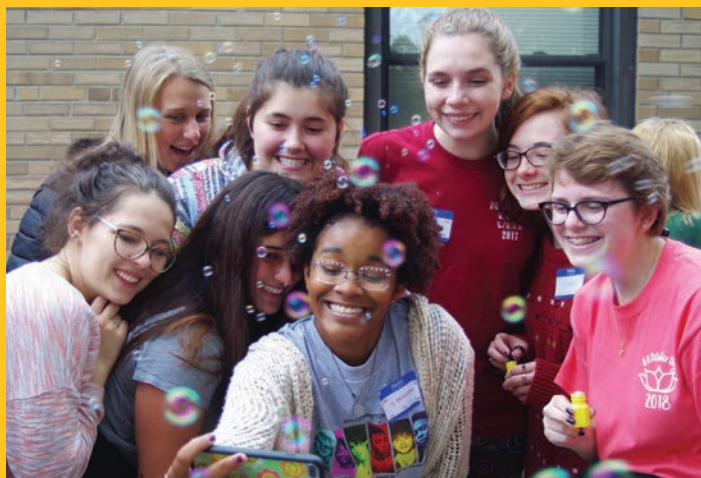
October Day, October 2018