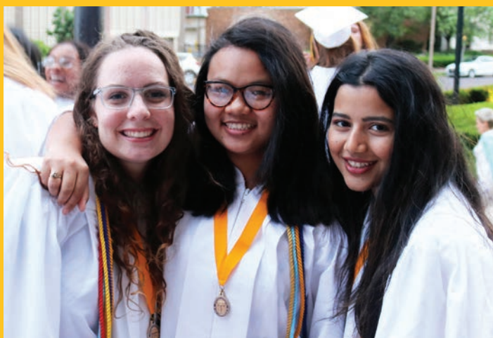
Graduation, May 2019