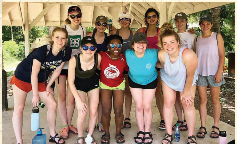
Taking a break near Blue Creek, Belize before hiking Belize's extraordinary landscape.

catalysts for the encounter with various people in St. Peter Claver Parish in Punta Gorda. Our evenings were spent sharing a variety of Belizean meals with parishioners who shared their stories with our students and listened to the students' narratives in turn. Over dinner tables and paint buckets, card games and lagoon waters, the communities of Rosati-Kain and St. Peter Claver Parish have forged a bond that will grow and strengthen for many years to come.