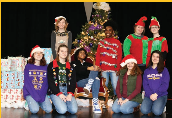
Breakfast With Santa, December 2018