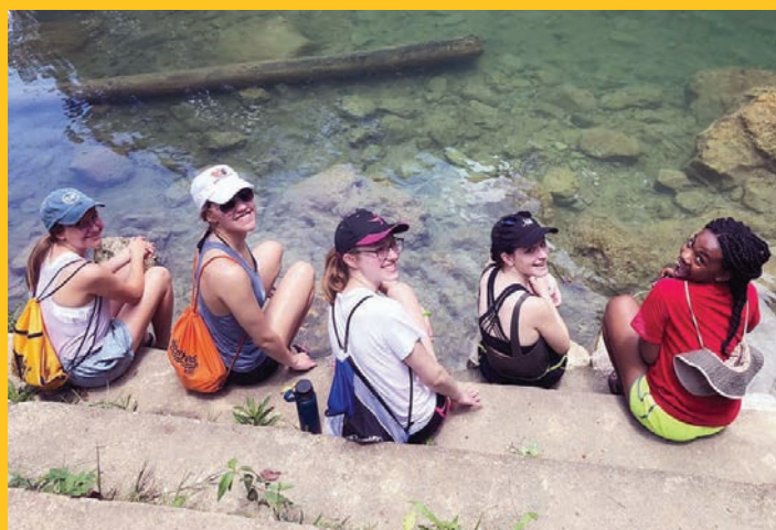
Summer Immersion Trip to Belize, June 2019