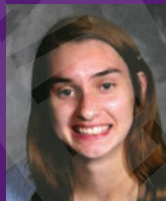
Archbishop May Service Award