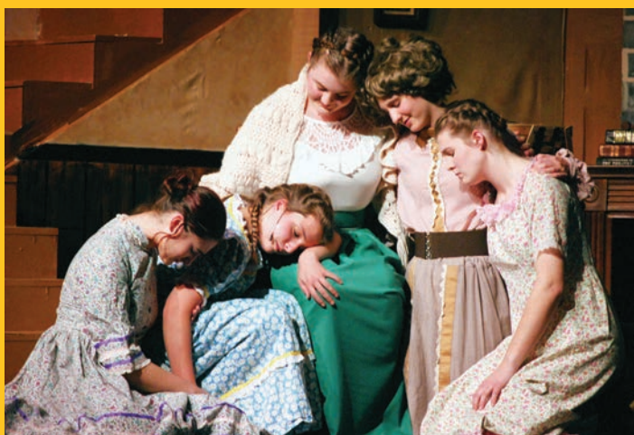
"Little Women," November 2018