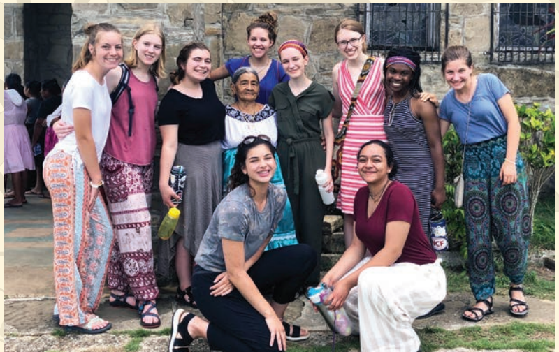
R-K students in San Antonio, Belize sharing in a festival celebrating the founding of the village.

Many days of the trip spent painting a parish hall or organizing grade school scholarship packets acted as