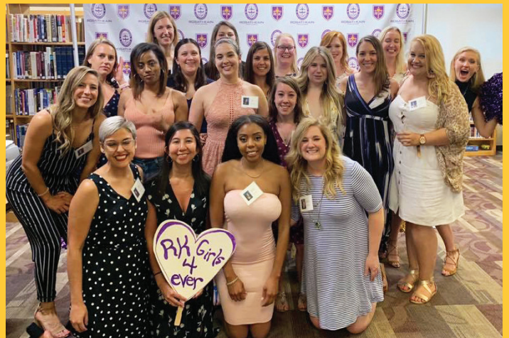
Class of 2009