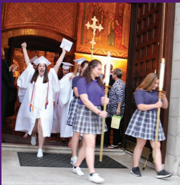
Students leaving the cathedral as Rosati-Kain alumnae for the first time.