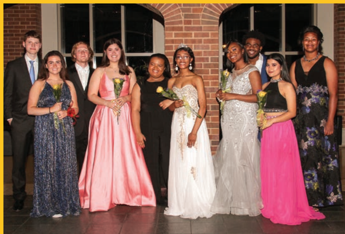
Senior Prom, April 2019