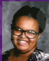
Dr. Martin Luther King, Jr. Model of Justice Award