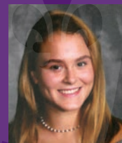
Chris Harris Award