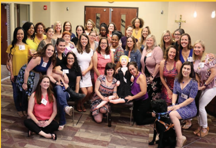
Class of 1999