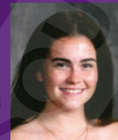
St. Louis Post-Dispatch Scholar-Athlete Award