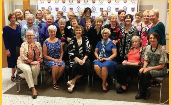
Class of 1963