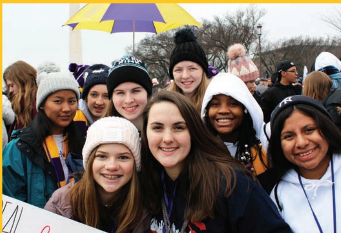
ProLife Trip, January 2019