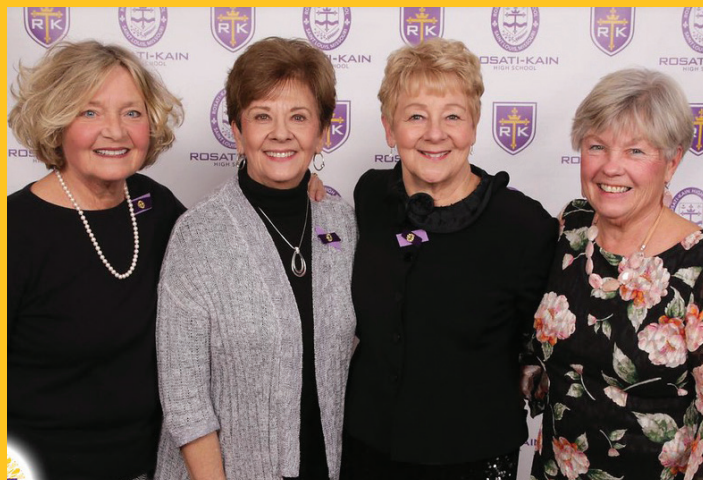
Kaleidoscope Dinner Auction, February 2019